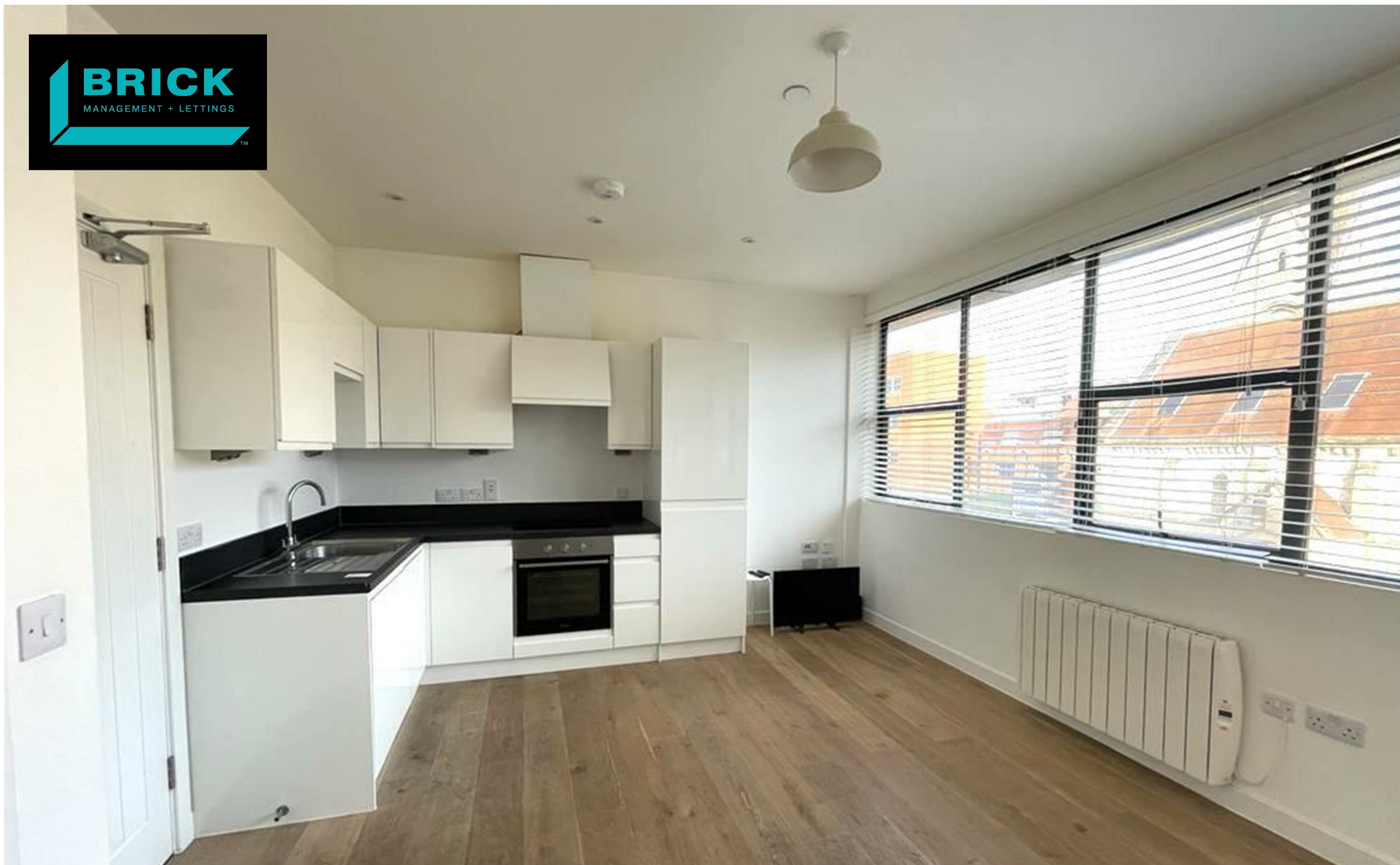
*9 Pilgrim House 22-26 Commercial Road, Southampton, Hampshire, SO15 1GE £895 Per month